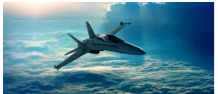
AEROSPACE AND DEFENSE