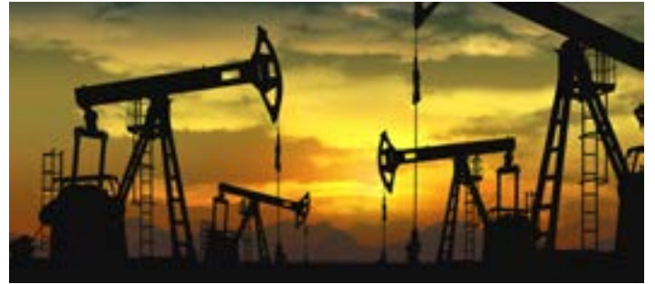
OIL AND ENERGY