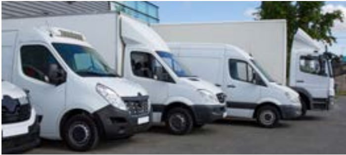
TRANSPORT AND AUTOMOTIVE